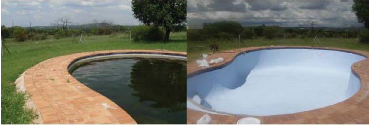
Sealing and painting of the pool at Roodeplaat Youth Centre Maintenance Project (Before & After)