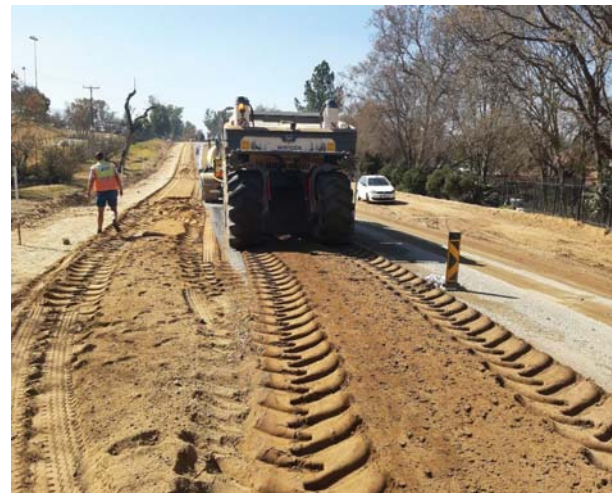
P39/1 Heavy Rehabilitation from km30 Diepsloot to km43 Muldersdrift approx. 14.35km