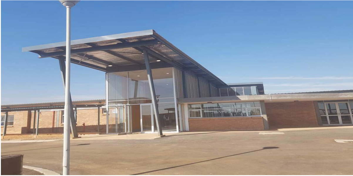
KHUTSONG SOUTH CLINIC