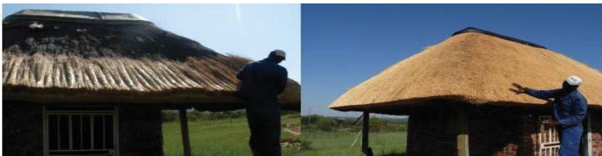
Rethatching of the Lapa at Roodeplaat Youth Centre