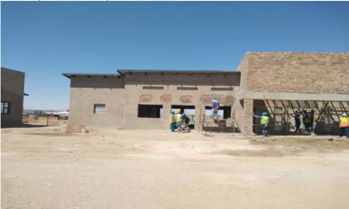
Devon Early Childhood Development Centre