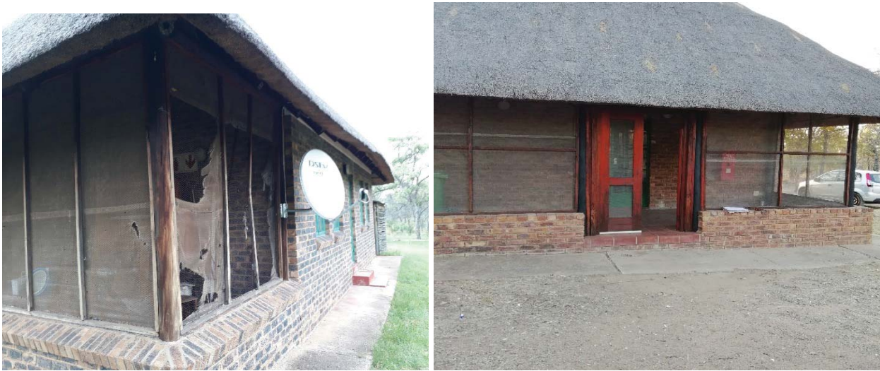
Repairs to staff houses at Leeuwfontein Nature Reserve - Maintenance Project (Before & After)