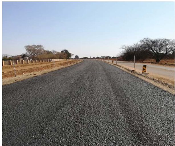
Rehabilitation of Road P175/1 from Vanderbijlpark to Potchefstroom Phase 2